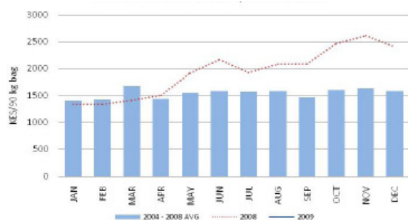
Fig. 2: Wholesale prices for maize in Nairobi