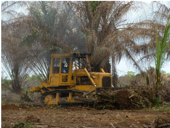
Clearing of lands for a nursery establishment at a SOCFIN plantation near Kortunahun village, Sierra Leone.

different. Nevertheless, the two countries share certain features when it comes to small-scale agriculture.