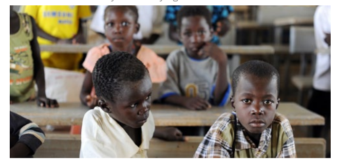
MDG 2: Preparation for their future at school